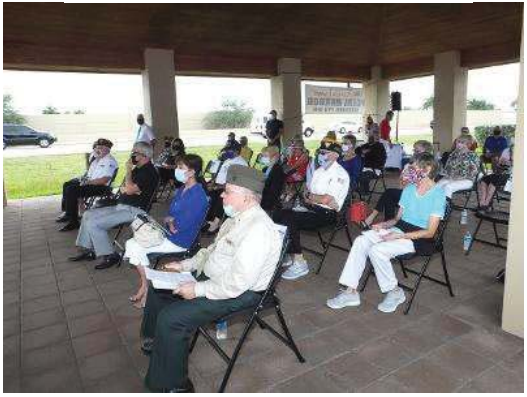
Our socially-distanced audience