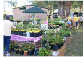
Our Plant booth 2019