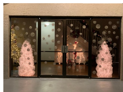
The stunning Entryway Decorations