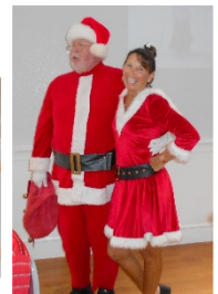
Santa and Mrs Claus-Block