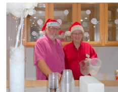
Our Jovial Hosts