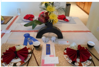
Table setting for two

A functional table set for service of 2 people with a decorative unit (a completed floral design using plant material and other accessories) included. A container-grown plant alone is not a design. Staged on a 30"