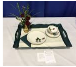
Example of tray design for

A tray (supplied by exhibitor) for one, with a Decorative Unit in proportion to the one place setting. Will be staged on 1/4 of a 6' table covered with a beige cloth provided by the Committee. Space allotted measures 36" W x 15" D x 29" high, freestanding. The tray requires an appropriately-sized Decorative Unit with the stability of the Decorative Unit given importance.