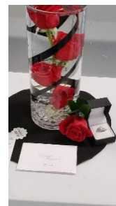
Example of petite underwater design

A creative design staged on 18" of a black painted surface 42" high provided by Committee, having some or all plant material and other optional component(s) submerged in water. Plant material and other components under water must contribute to the overall design and are selected for their lasting quality.