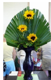
Example of a duo design (front)

A creative design staged on half of a 6' x 30' x 29" high table covered with a beige cloth supplied by Committee. Design is organized in one container or containers joined to appear as one. Organized as two designs back to back and entered in two separate design classes with the schedule specifying both titles. Each side appears as a distinctly different design. Staging must