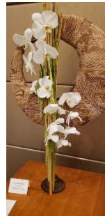
Example of a creative line design:

A creative design where line is dominant with a minimum of plant material and other optional components. The line may be straight, curved or a combination. There may be one or more points of emergence and focal areas. Use of a two-dimensional 48" x 32" wide staging panel is suggested. Underlays supplied by exhibitor are permitted.