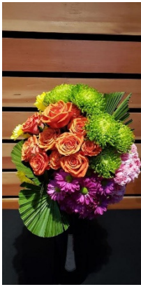
Petite creative mass design example

A creative design staged on 18" of a black painted surface 42" high provided by the Committee, emphasizing a greater proportion of plant material and components other than space. The silhouette of the design is visually closed, and rhythm contained within. Open spaces may be incorporated within the closed silhouette. Designer underlay optional.