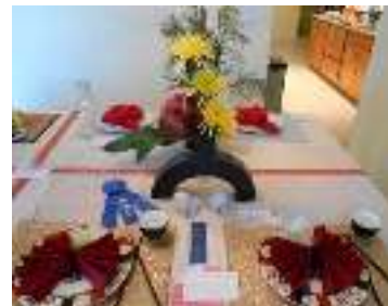
TABLE SETTING FOR TWO

A functional table set for service of two people with a decorative unit (a completed floral design using plant material and other accessories) included. A container-grown plant alone is not a design. Staged on a 30” square card table supplied by the committee. Exhibitor should supply a suitable table covering.