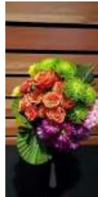
PETITE CREATIVE MASS DESIGN EXAMPLE

A creative design staged on 10” of a black painted surface 48” high provided by the Committee, emphasizing a greater proportion of plant material and components other than space. The silhouette of the design is visually closed, and rhythm contained within. Open spaces may be incorporated within the closed silhouette. Designer underlay optional.