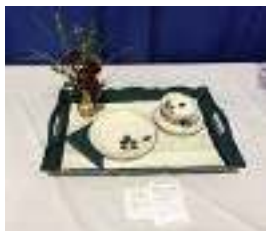
EXAMPLE OF TRAY DESIGN

A tray (supplied by exhibitor) for one, with a Decorative Unit in proportion to the single place setting. Will be staged on 1/4 of a 6' table covered with a beige cloth