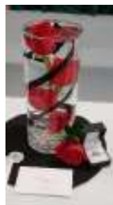
EXAMPLE OF PETITE UNDERWATER DESIGN

A creative design staged on 12” of a black painted surface 48” high provided by Committee, having some or all plant material and other optional component(s) submerged in water.