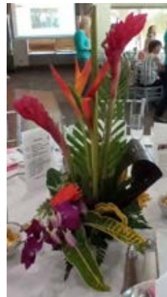
THE ELEGANT TABLE SETTINGS AND BARBARA SERY'S BEAUTIFUL TABLE CENTERPIECES