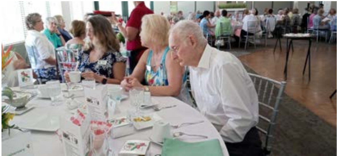
GENERAL SHOT OF THE ROOM