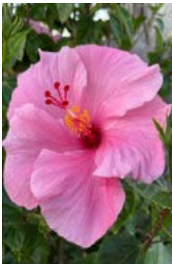
HIBISCUS SEMINOLE PINK