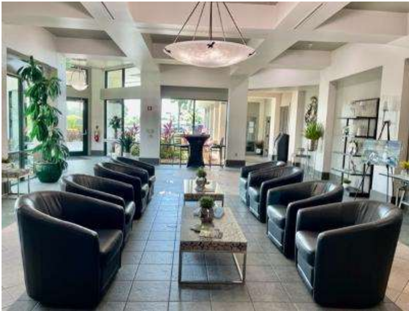
PALMETTO PINES FOYER