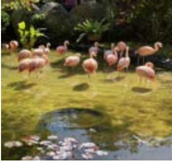
Nancy Finnegan - The beautiful flamingos!