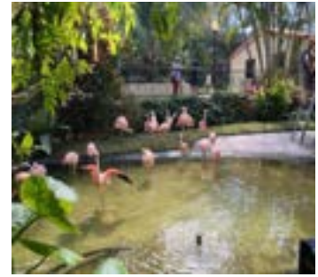
Sylvia Swartz - The flamingos were both beautiful and fascinating to watch