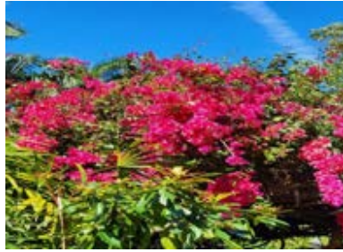
Joanne Kishfy - Bougainvillea 20 feet high