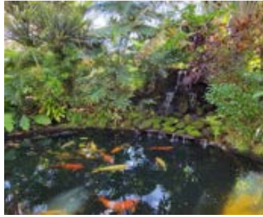
Karen Kight - I thought the waterfall and fish made a lovely view!