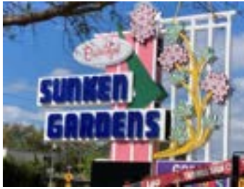
Lois Lubber - The new sign ... beautiful and classic design