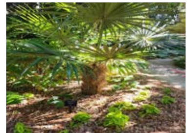
Sherry Embrey - the Old Man Palm, Coccothrinax crinita